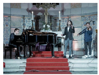
Example of an event

Kultur Büro Elisabeth gGmbH Invalidenstr. 4a 10115 Berlin Tel 030 – 4404 36 44 Fax 030 – 4404 23 62 info@elisabeth.berlin www.elisabeth.berlin